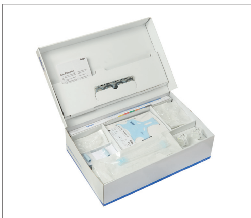
BabyFlow® plus Demo Pack