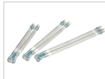
BabyFlow® plus disposable