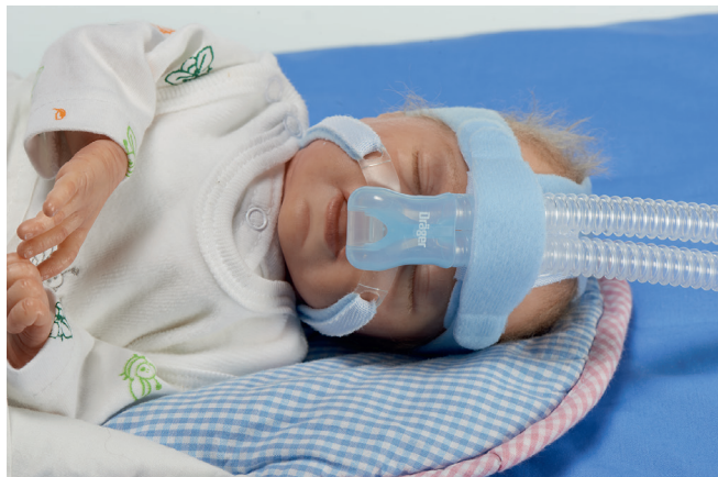
Application of BabyFlow plus on pre-term infant

Not all products, features, or services are for sale in all countries. Mentioned Trademarks are only registered in certain countries and not necessarily in the country in which this material is released. Go to www.draeger.com/trademarks to find the current status.