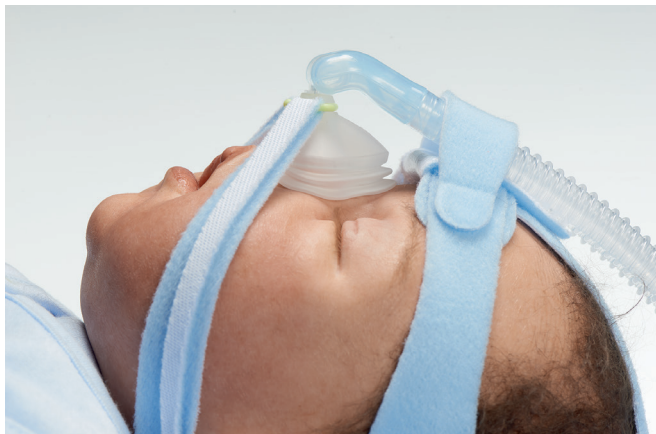
Application of BabyFlow plus with mask on full-term infant