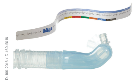
BabyFlow® for disposable use with measuring tape